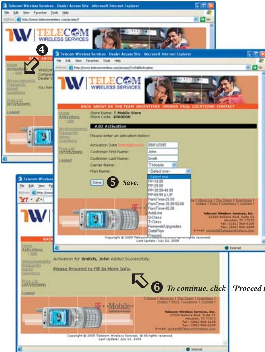
Figure 2. Section A: Enter: Activation Date, Customer First & Last Name, Carrier and Plan.